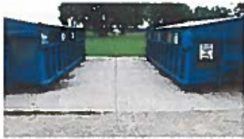
Casco Township, Allegan County