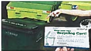
Southeastern Oakland County Resource Recovery Authority