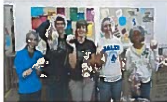
Feeding America West America