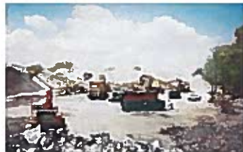
Resource Recovery Corporation of West Michigan