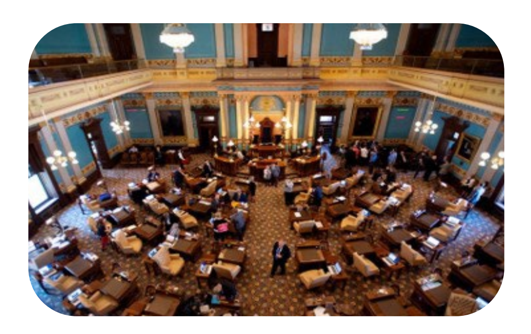
Michigan State Senate Floor