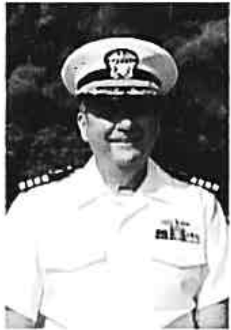
Wearing his Navy "whites."