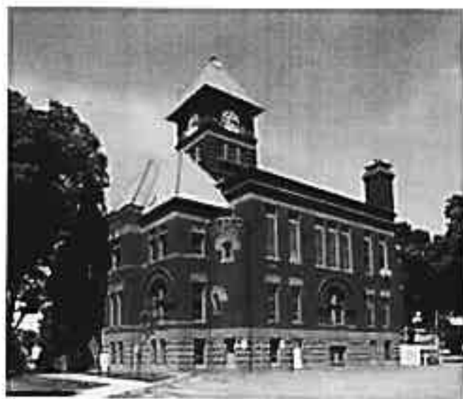
Mason County Courthouse in Eudington