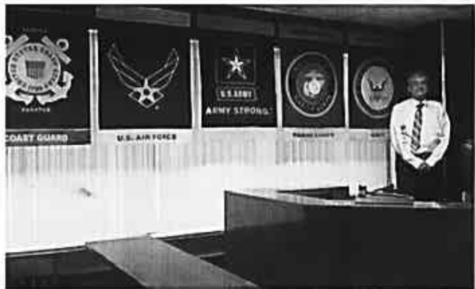
Judge Bronson's courtroom displays flags to represent each military branch of service.