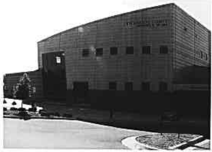
The Kalamazoo County Juvenile Home is home to the KEYS program.